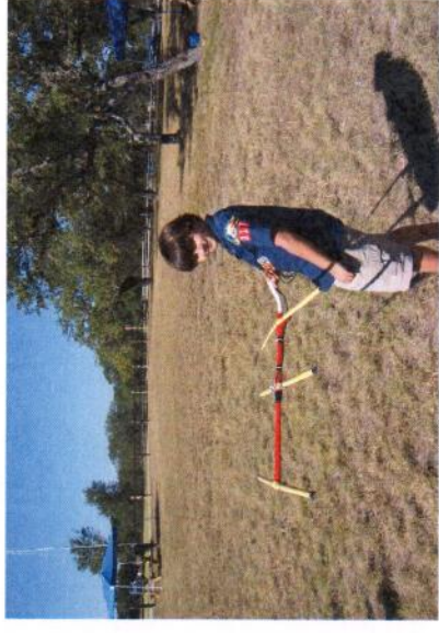
Radio Direction Finding